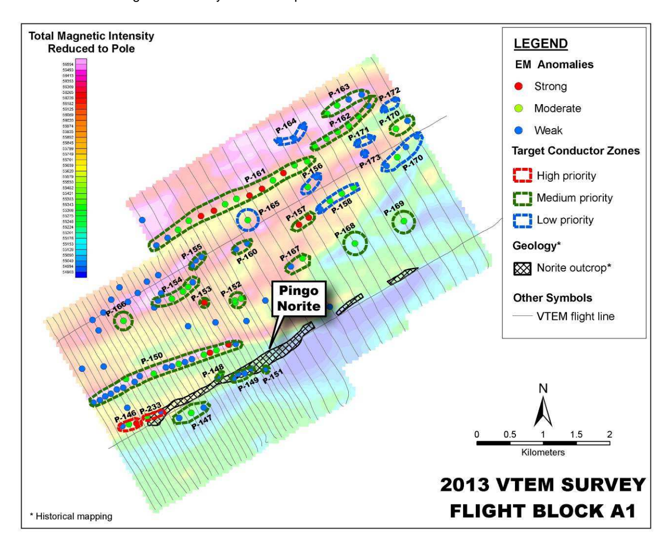
Figure 2 : Map of 2013 VTEM survey block A1 showing electromagnetic anomalies, target conductor zones and total magnetic intensity reduced to pole.